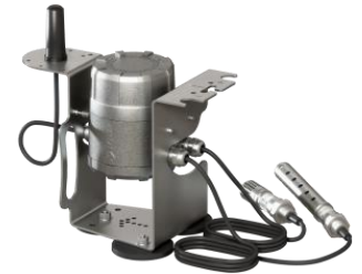
PCU-X01 Sensor Hub w. HCD/Ws