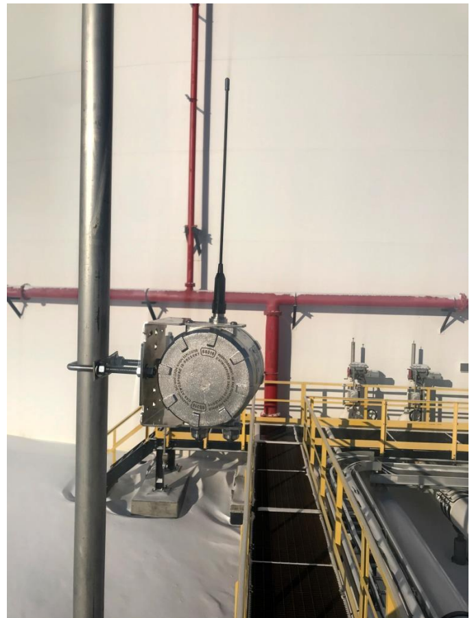
Syscor's PCU-X00 Repeater mounted to an existing pole with the Universal Mounting Bracket and U-bolt.

Syscor's Polymer Absorption Sensor and WirelessHART technology was developed in close cooperation with the petroleum industry