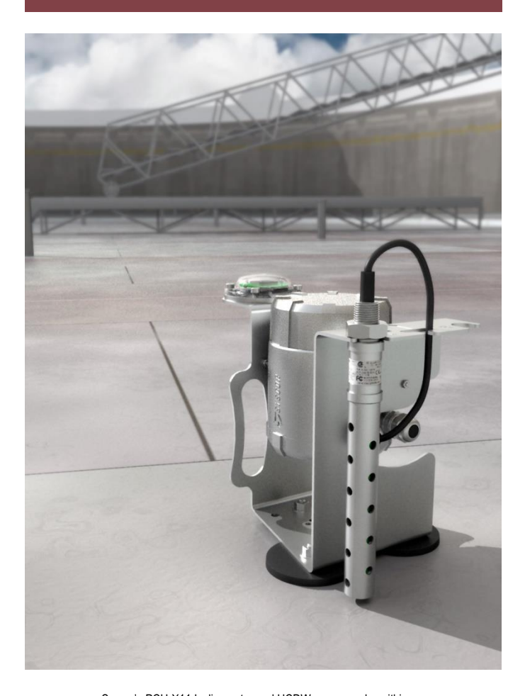
Syscor's PCU-X11 Inclinometer and HCDW sensor probe within the magnetically mounted Floating Roof Mounting Bracket

Syscor's Polymer Absorption Sensor and WirelessHART technology was developed in close cooperation with the petroleum industry